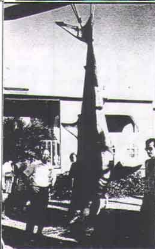
had a large jaw and very large teeth.